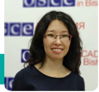
Madina (Kyrgyzstan) Doctoral Studies in Business and Management