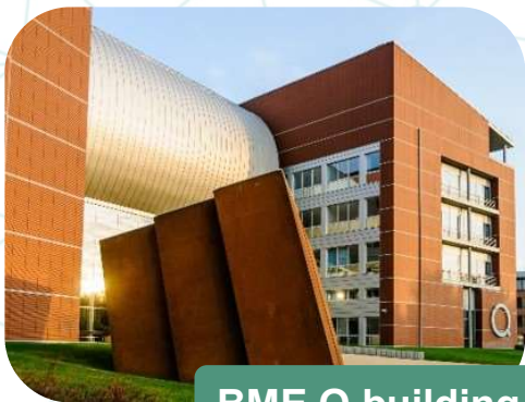
BME Q building

Classroom numbers are listed in the Neptun system. Each number starts with a letter for the building, followed by a letter for the wing, then a digit for the floor level, and finally the room number. E.g.: Room QA403 is located in Building Q, Wing A, on the 4th floor, Room 03.